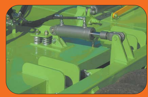
SHOCK ABSORBING SPRING SUSPENSION